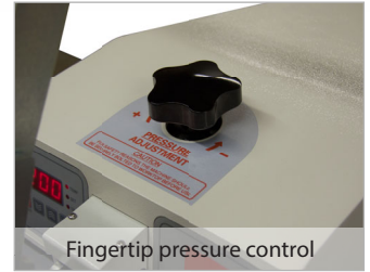
Fingertip pressure control