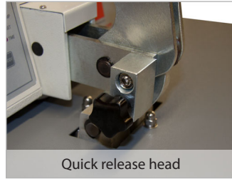
Quick release head